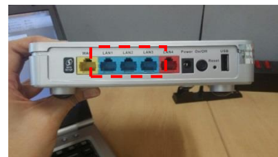
Wireless Router LAN ports

24 Why didn't I get the speed as advertised?